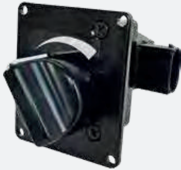
CAN rotary throttle modules